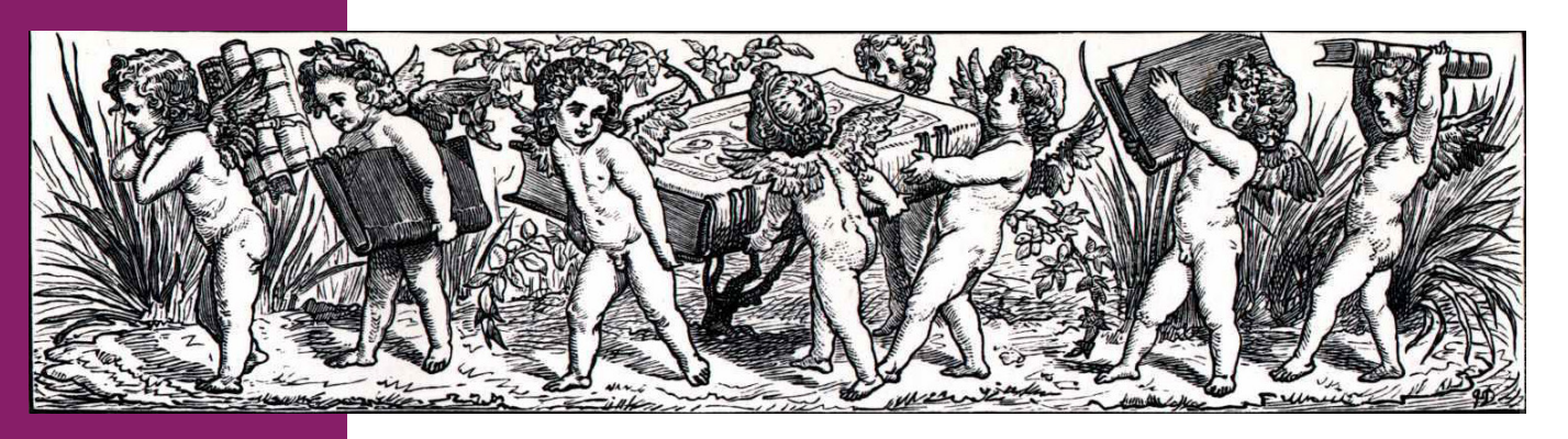
European Society for the History of the Human Sciences